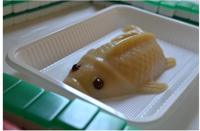
You can find nian gao like the one pictured above in all sorts of establishments in Flushing.

1,000 years. During the Liao, Ming, and Qing dynasties, nian gao was a popular snack. So if you haven’t tasted it yet, make sure to go buy some! .