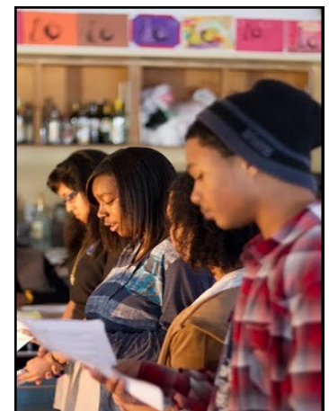
Performers from the East-West Poetry Slam