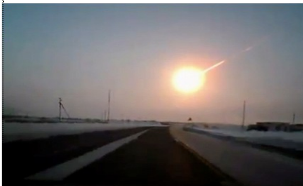
A photograph taken by a Russian taxi cab driver of the meteor flying across the sky

As the meteor broke into fragments it created a loud sound wave which is what caused most of the destruction to people's property. Astronomers in Russia say that they believe that there will be no more meteors in the region for a long time. A series of video streams and news events have resulted from this astonishing natural occurrence. Get on your laptops, phones, tab-