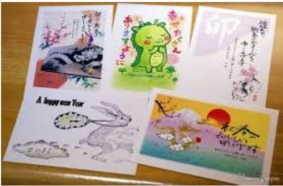
You can get nengajos from your friends and family.

There are certain ways of giving Nengajo to others. You can either make nengajos or buy them. Usually, they contain a lottery number on the right-hand corner. They'll also contain Japanese New Year greetings such as あけましておめでとうございます. Akemashite omedetou gozaimasu means Happy New Year . You can also say, 今年もよろしくお祈りします (Kotoshimo yoroshiku onegaishimasu) meaning, kind regards/thanks for putting up with me/thank you in advance for this year . There's also 旧年中はお世話になりました (Kyunenchu wa osewani narimashita) meaning, thanks for everything you did/taking care of me last year . Another thing you can write is ご健康とご多幸をお祈り申し上げます. Gokenshoutu gotakouwo oinori moushiagemas means wishing your family good health and happiness .