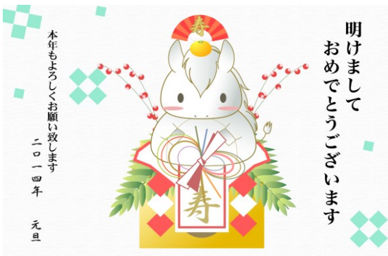
This is an example of a Nengajo . It's a horse Nengajo.