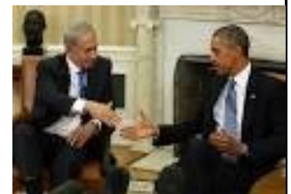
Netanyahu explains to Obama that he feels Iran is a nuclear threat.

Netanyahu is being cautious and that's a good thing. He wants to prevent future attacks on other countries including Israel. Personally, I feel three nuclear bombs just for safety precautions seems fair.