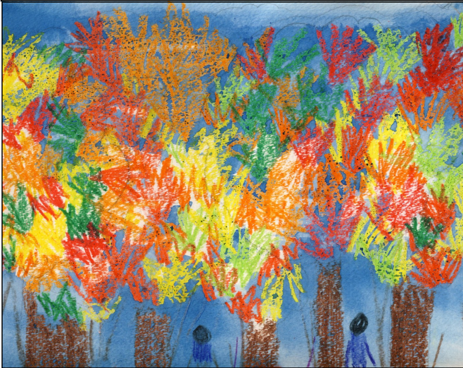
"Autumn Dusk" by Krystal Cheung, Grade 6, pastels and crayon on paper