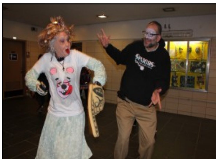
A wild Miley Cyrus appears!