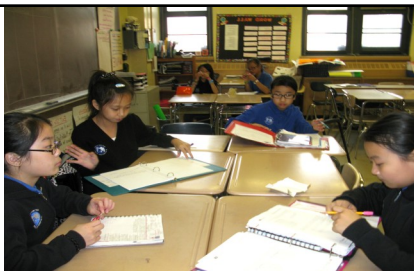
OST students doing homework.

OST meets Monday-Friday in the auditorium. Monday -Thursday 3-6 Friday 2:20-5pm. There is an application process and a waiting list.