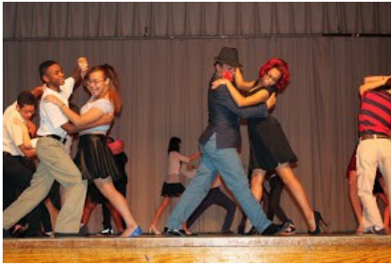
East-West high school dancers strutting their stuff for a packed auditorium