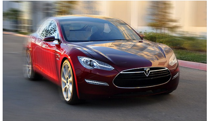
Say hello to the Model S

The Model S is a full-sized five-door car that runs entirely on electricity. When the Model S becomes popular, Musk intends to build recharge stations throughout the world that will help maintain the demand for these cars.